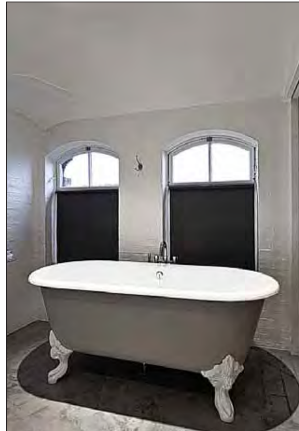
Mixers: Julia loves greys, using them for the bath, floor and blind