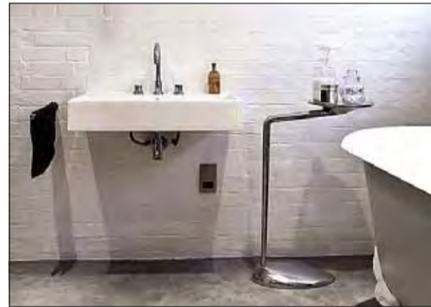
Washroom: painted white walls give the room a stark beauty