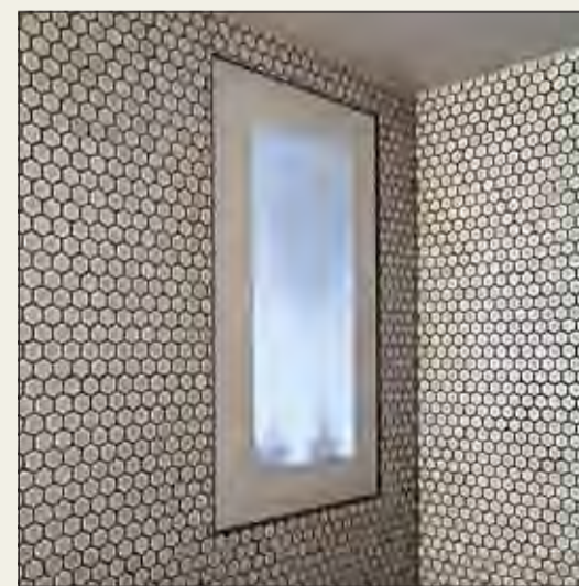
Sleek finish: small hexagonal porcelain tiles greatly increase the sense of space

porcelain tiles, which greatly increase the sense of space. But it was his idea for converting the horrible windows that was truly transforming: he has had them covered with translucent Perspex, set into touch-latched frames, which means they can be opened for ventilation without the feel of the room being spoiled. "Details matter a great deal," he says.